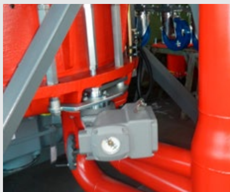
Pfister® AutoGAP 2.0 actuator